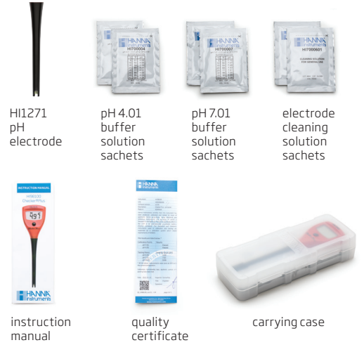
HI1271 pH electrode