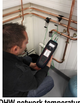
DHW network temperature Ambient CO checking