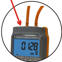
PC connection port