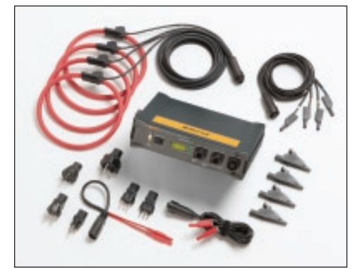
Fluke 1744/43 Fluke 1745