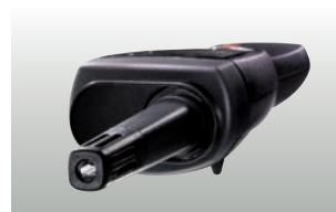
testo 625 with attached probe head