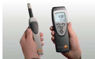
testo 625 with radio handle and radio module