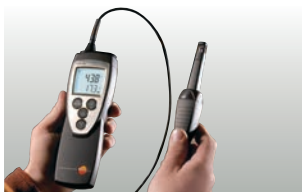
Moisture probe head via handle with probe wire