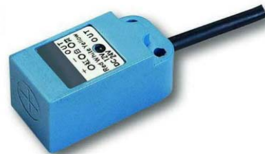
PX-01 ( Optional )